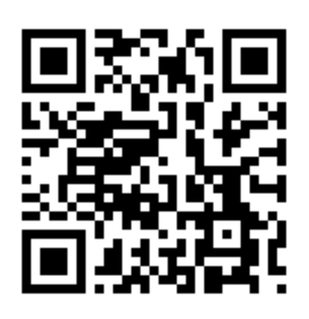
Scan here to access the public documents for this meeting